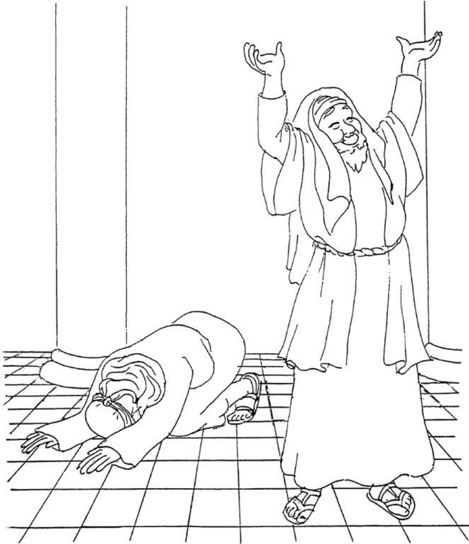
The Parable of the Pharisee and the Tax Collector

Copyright © CalvaryCurriculum.com Used by permission