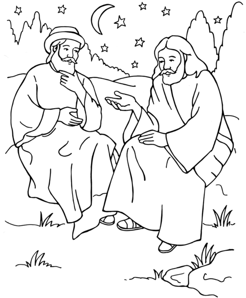
Jesus and Nicodemus John 3