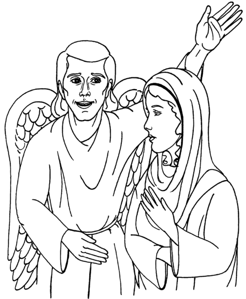
The Angel Gabriel Appears to Mary Luke 1:26-38