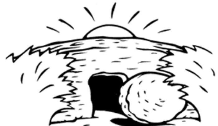
"He has risen! He is not here." Mark 16:6