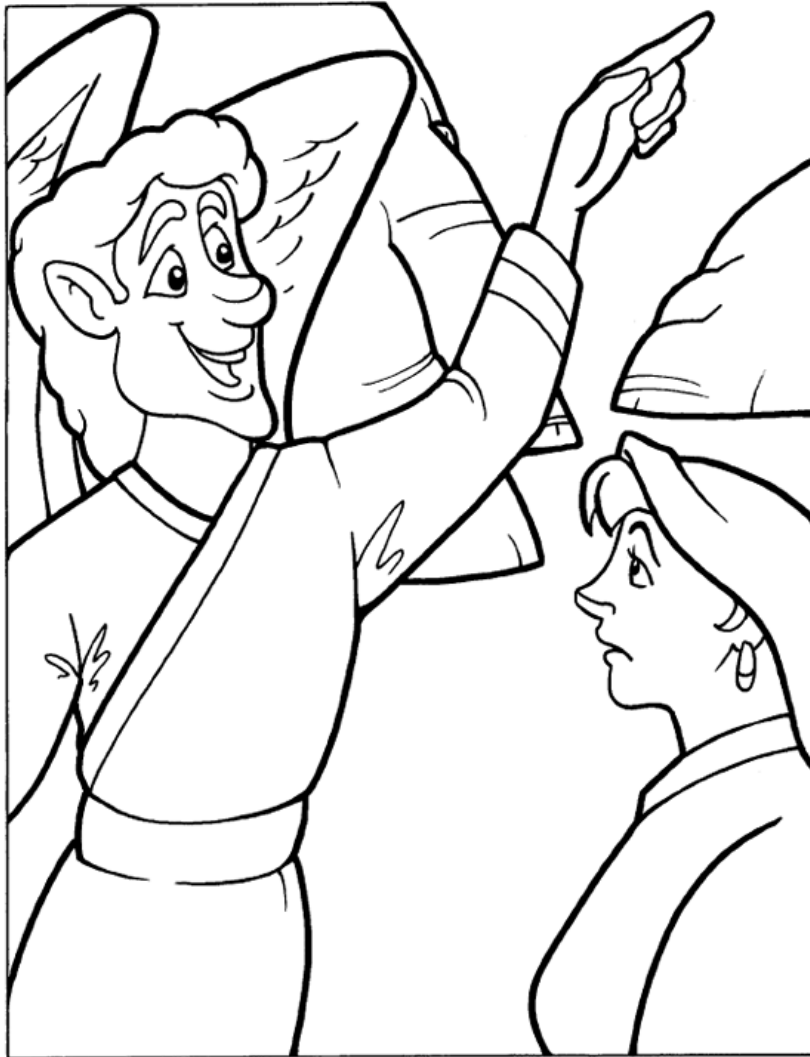
"He is not there, he is risen" Mark 16:6